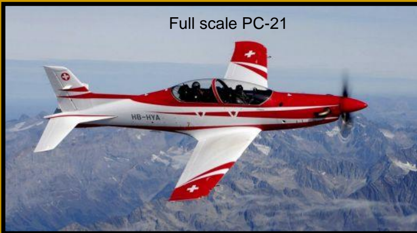
Full scale PC-21

This is a view of the turboprop engine installation. In effect the turbine exhaust is viscous coupled to the prop drive