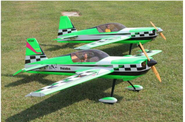
MX2 reunion; gas or electric?