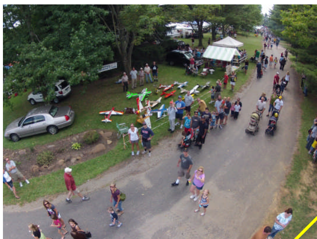
Quad-rotor view of MVRC at Cedar Creek Park Fest