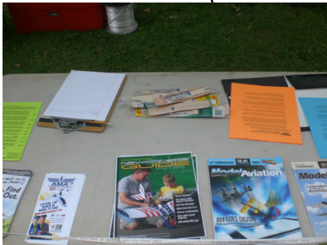
Handouts to spectators, AMA, & Newcomers