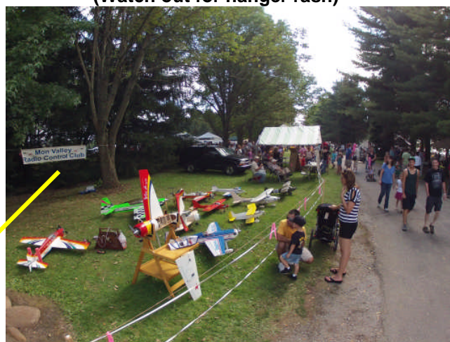
Our new banner put to good use at the funfest