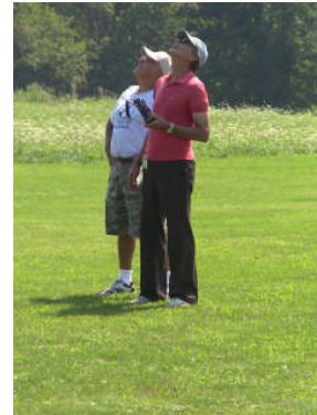
Still looking for the glider?