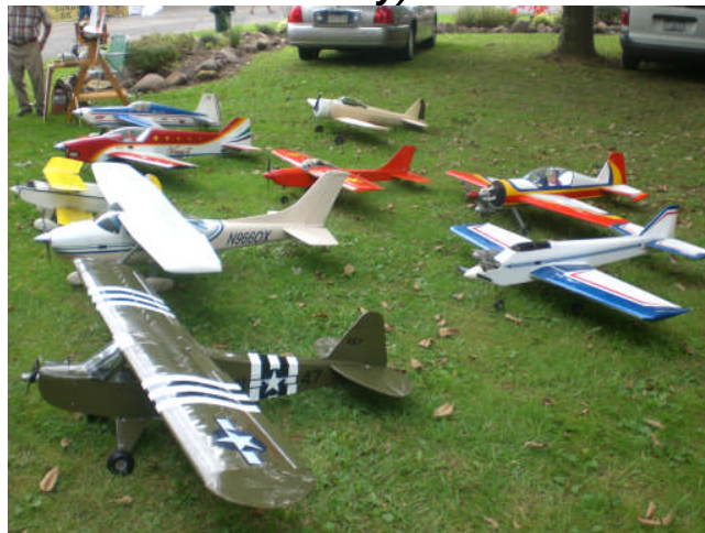
Airplane Display (Joe, Bob, & Al)