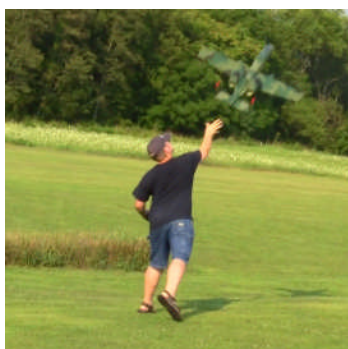
“Up-up and away”