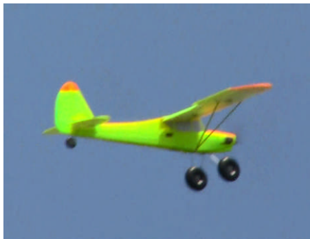
The large foam wheels solve high grass problems