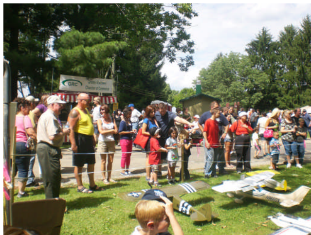
Lots of Very Interested Spectators