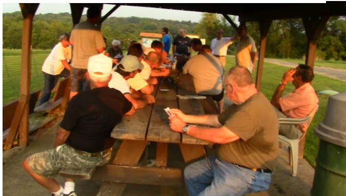
Last outdoor meeting of the summer