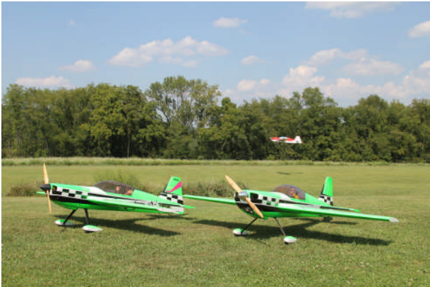
Stereo MX2s with background air traffic