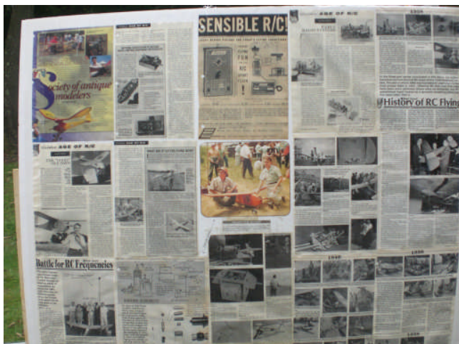
History of RC