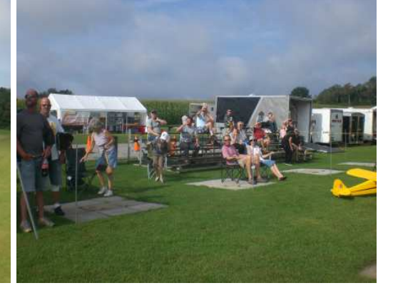
Spectators at bleachers