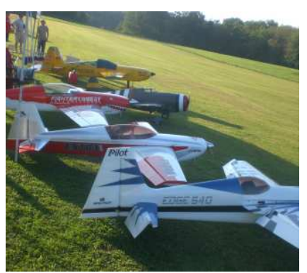
Planes waiting in pits