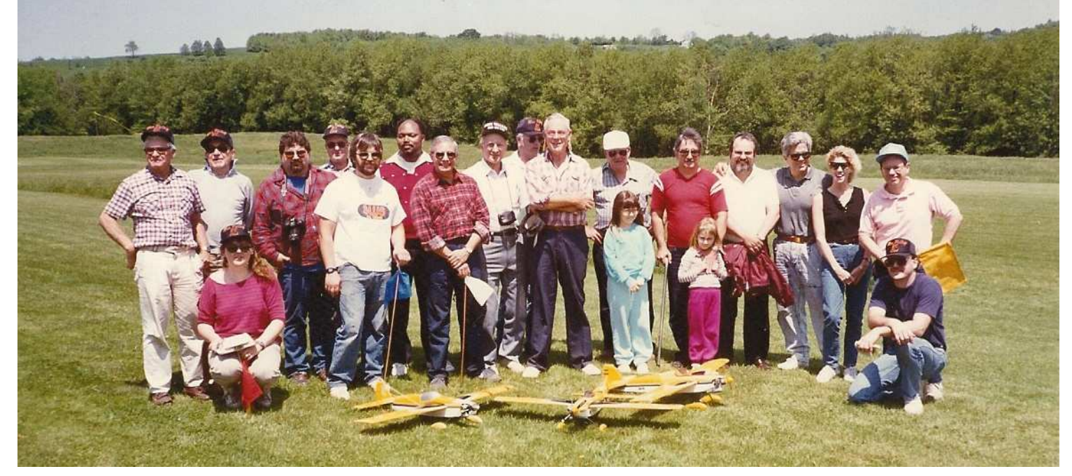
(From George Blum's album--See if you can name the members and guests!!)