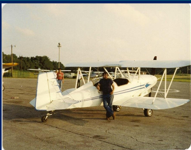
George Wilson with magnificent scratch built Wichawk at Rostraver, mid 1970's. (No, he didn't build it.) It's a three-seat biplane. Two in front, one back seat.