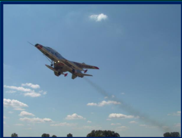
Bob Violett making a low pass at the Heart of Ohio Jet Scramble with a "borrowed" full scale F100 Super Sabre. YeeeeHaaaaa! ;}