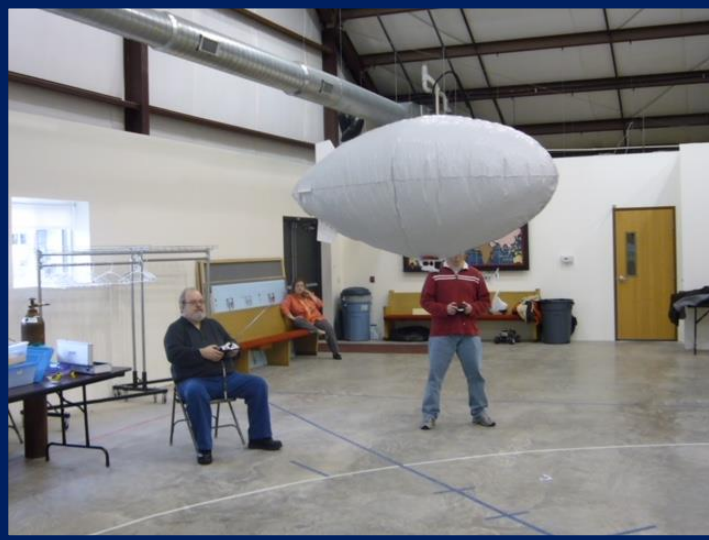
Flying a blimp at Pricedale.

Thank you to members who have given us this great addition to the newsletter and for taking the time to provide us with these special memories. Please continue to send your photos and captions to us.