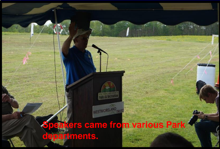
Speakers came from various Park departments.