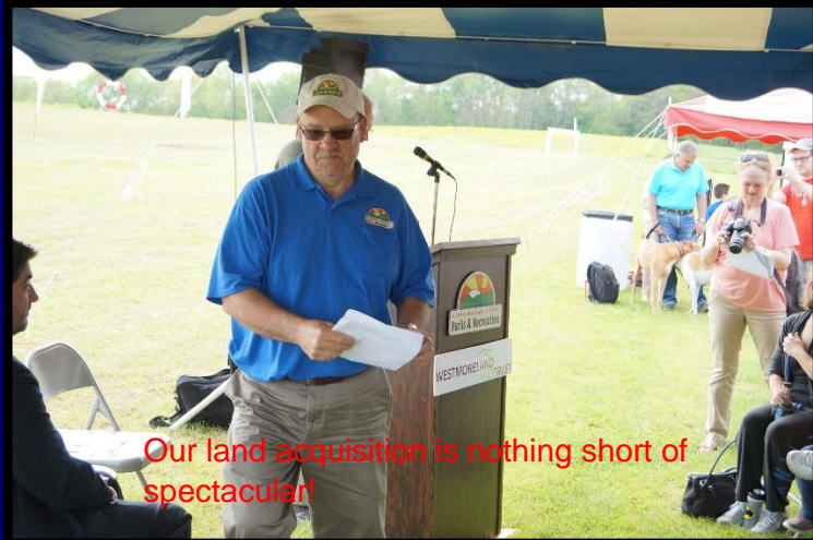
Our land acquisition is nothing short of spectacular!