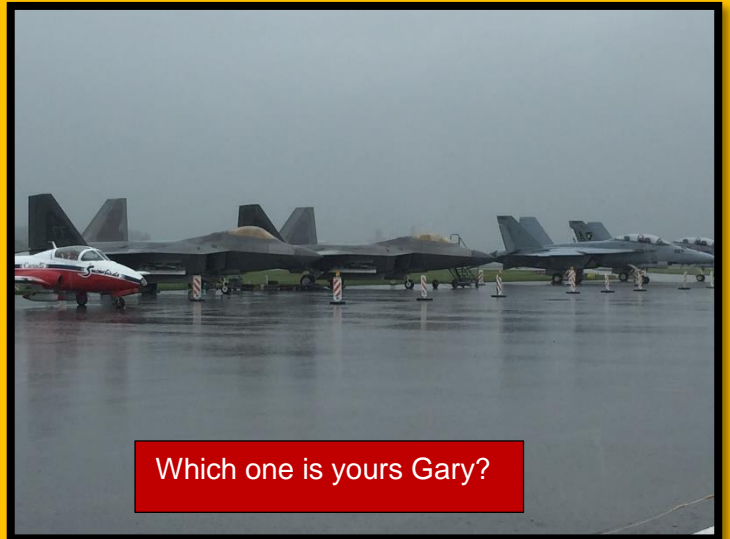
Which one is yours Gary?