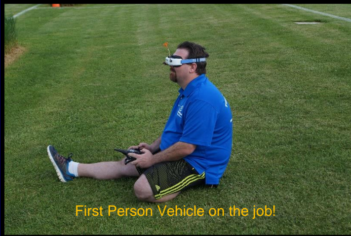
First Person Vehicle on the job!