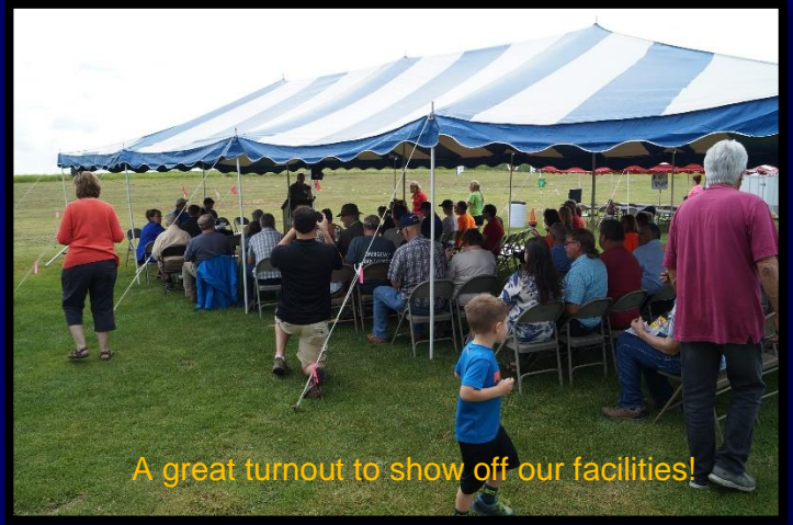
A great turnout to show off our facilities!