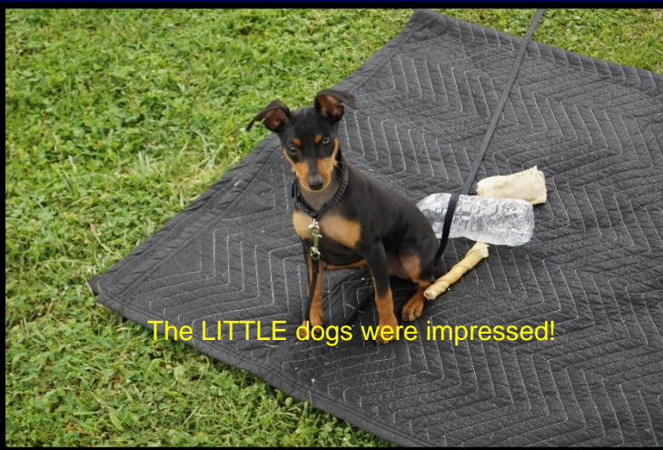
The LITTLE dogs were impressed!