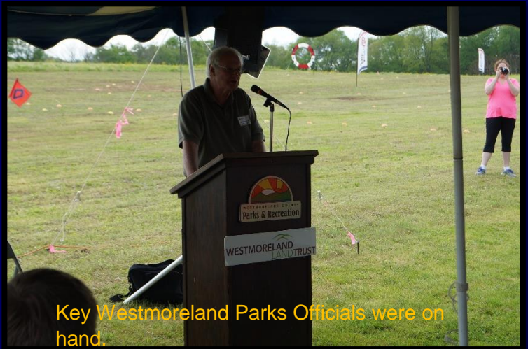
Key Westmoreland Parks Officials were on hand.