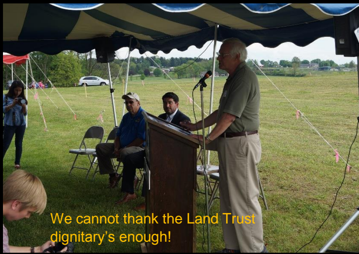
We cannot thank the Land Trust dignitary's enough!