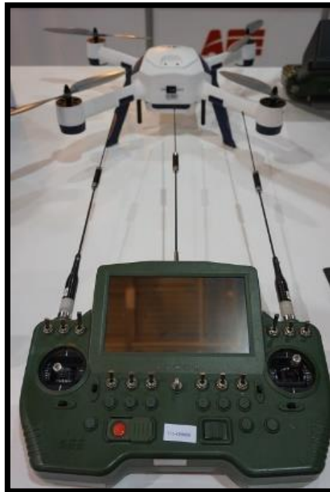
MIMO Radio Links.