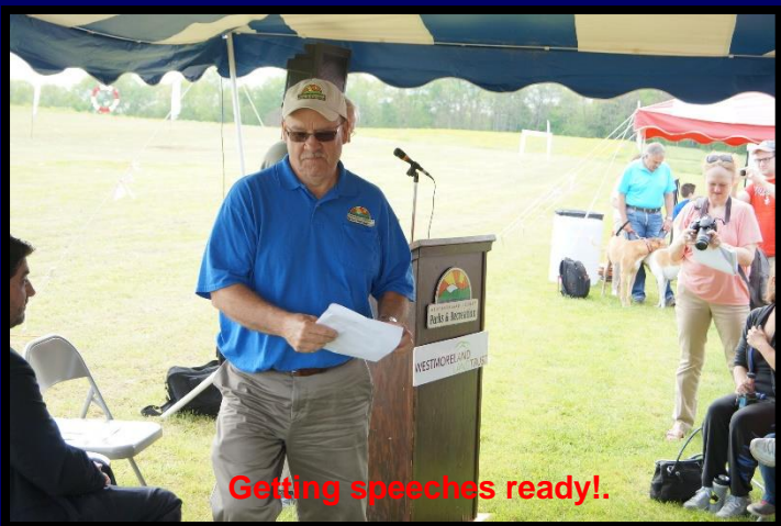
Getting speeches ready!