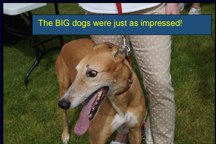
The BIG dogs were just as impressed!