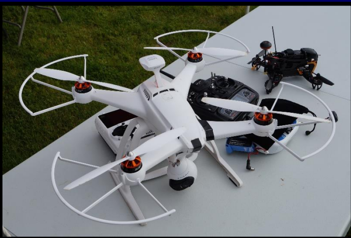
Not a bad give-away, huh?