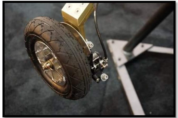
Now, this is a disc brake set-