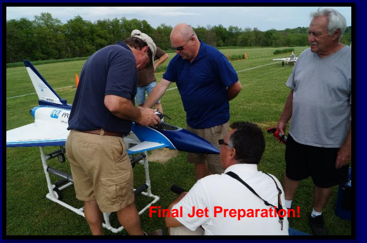
Final Jet Preparation!