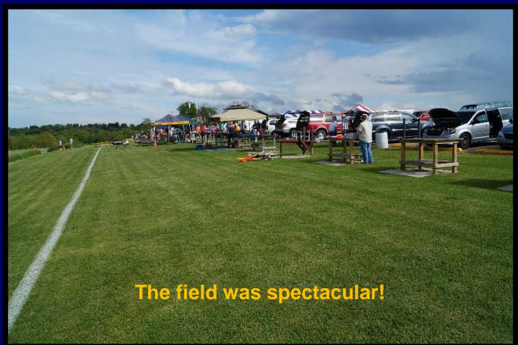
The field was spectacular!