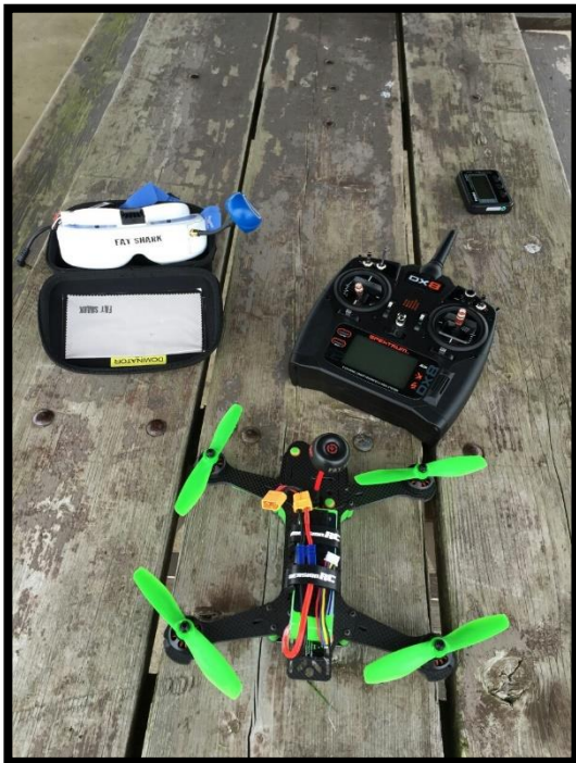
Eric's 250 Pro is ready to race!