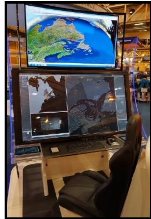
UAV Pilot Training Center!