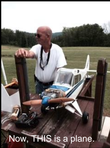
Now, THIS is a plane.