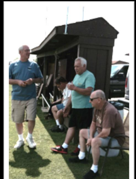
Ok, who is going to go up first?