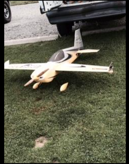
The aircraft's just keep getting better.