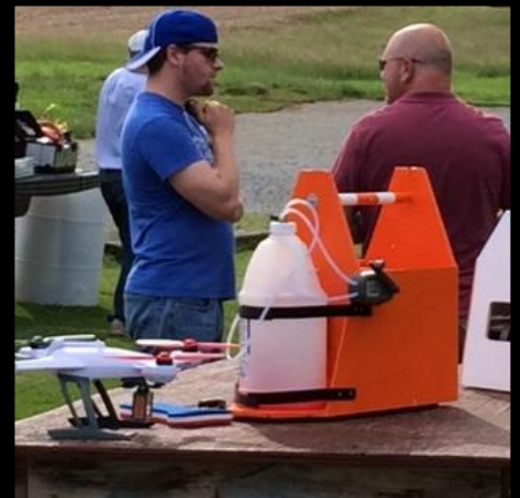
We need a strategy.