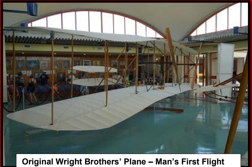
Original Wright Brothers' Plane – Man's First Flight