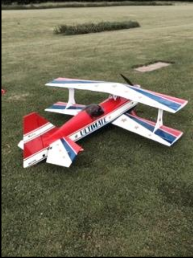
Now this is a real beauty!