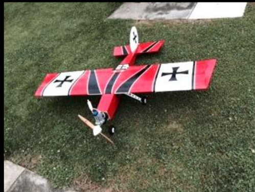
Walk softly and fly a Big Stik.