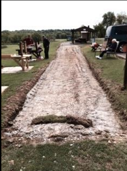
No, this is not a take off ramp!