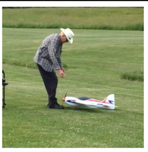
A beautiful day for flying.