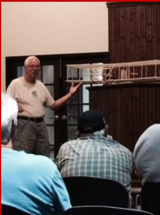
Photo taken from Kitty Hawk, NC