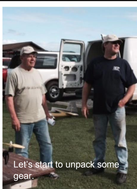
Let's start to unpack some gear.