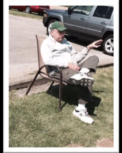
Time to relax and get some sun!