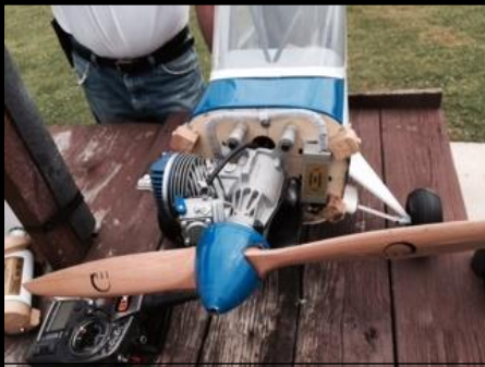
What a power plant!