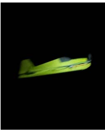
CNCFoamy Night Fighter