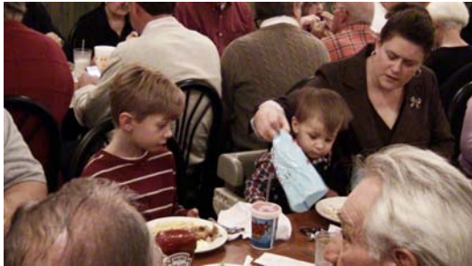
Children, in Christmas spirit