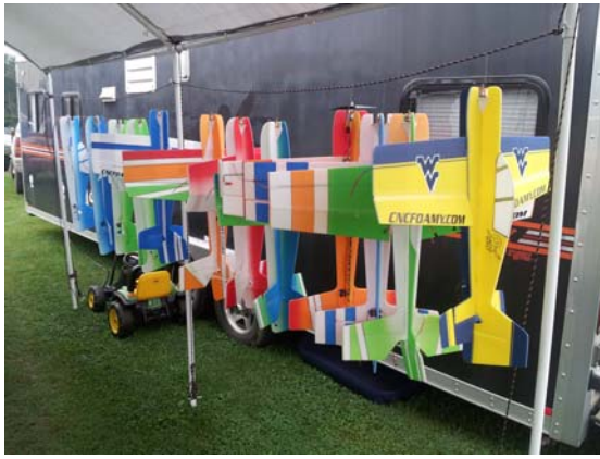
Foamies and more Foamies