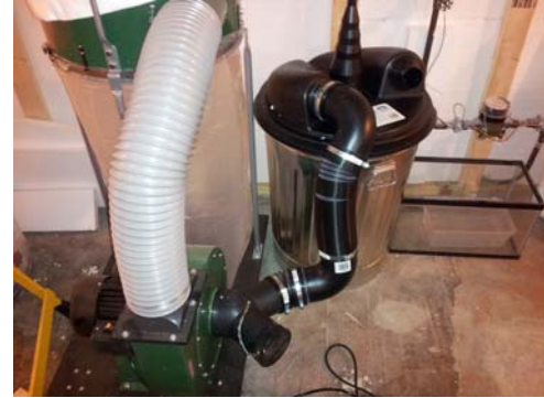
Dust Collection Equipment