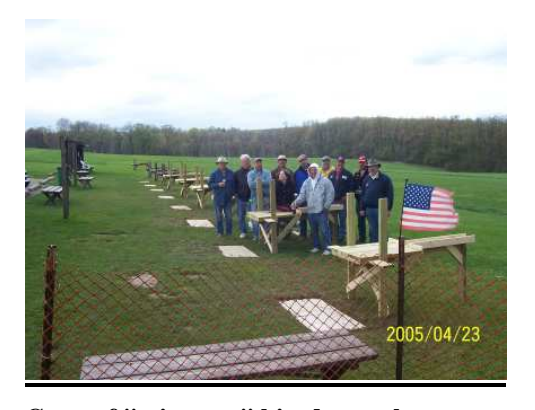
Gang of "migrants" hired to make new tables in 2005