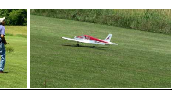
Howard Robb, home from Florida, flying & finally retrieving dead-stick The plane, recently, was grabbed by the trees towards the bike trail.