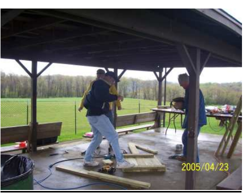
And members assembling them-lots of help.