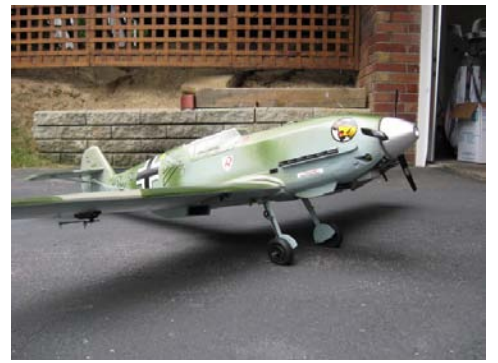
Royal Messerschmitt, built from kit by Joe Russo