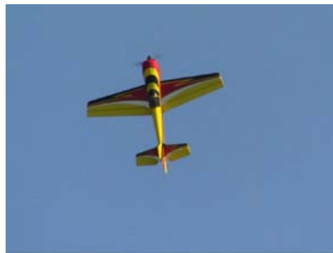
Ready to go