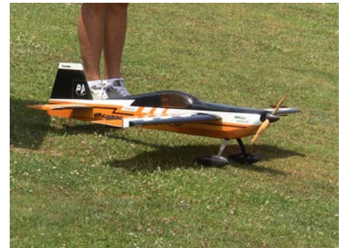
Don't look at the legs!!!