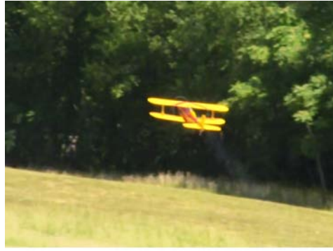
Fred Fronzaglio's Hog