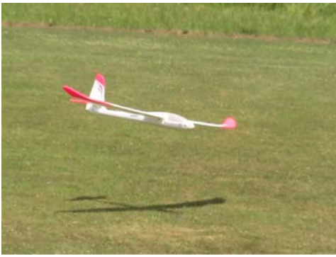
Back home safely