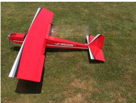
Nick's tow plane and glider