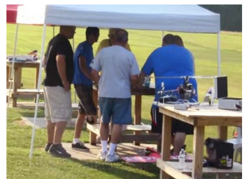
Helix is behind you!!!