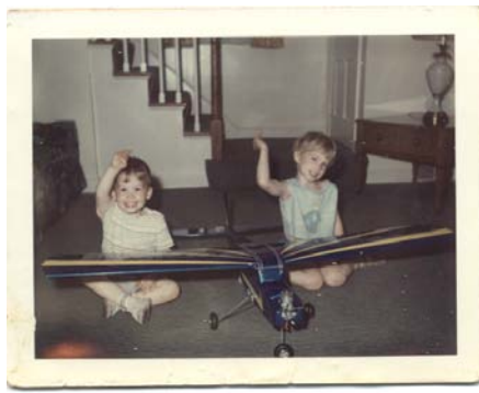
My first kit-Andrews A-Ray And two children-1969