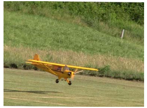
Fred's Piper Cub