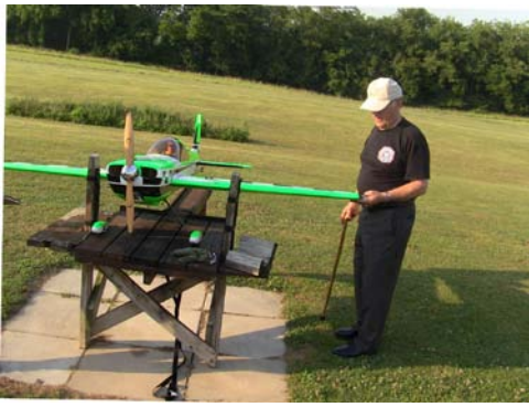
Bill Kirkpatrick, ready to fly