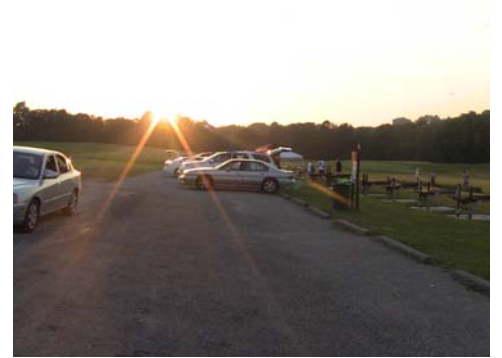
Get one more flight before sunset