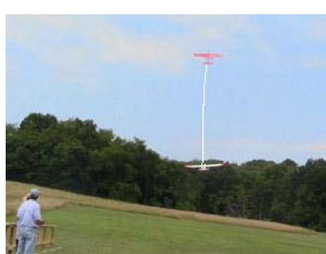
Towing in action, look closely