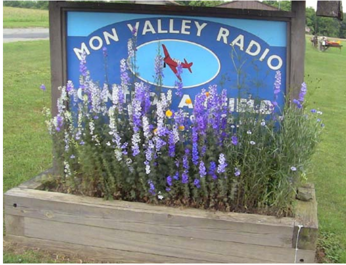
The MVRC Field views are spectacular and refreshing