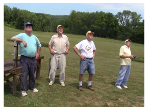
Four old f.. ts, mouths open,.... Looking for sailplane