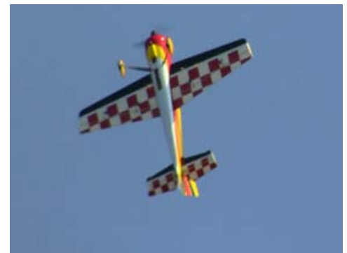
Up, up, and away