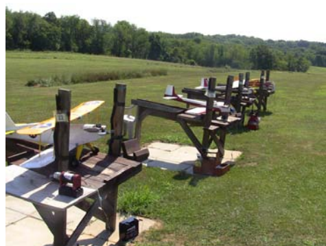
Tables full on a beautiful day