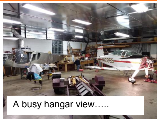
A busy hangar view.....