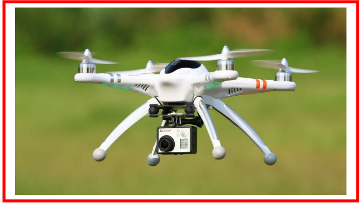
What's the real deal with these things anyway? Get the legal story right from the authority!!