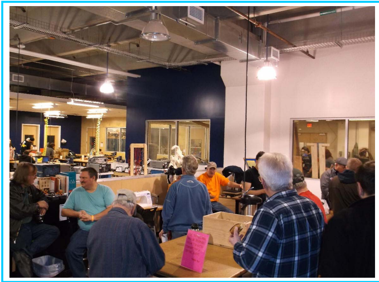
Picture above, a view of the Tech Shop in January at our meeting showing how clean and spacious is the facility.